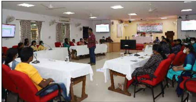
Quiz programme in progress

As part of 75 th Independence Day celebrations, NAAS-Coimbatore Chapter and ICAR-Sugarcane Breeding Institute, Coimbatore organized a 'Science Quiz' competition for college students on 12.08.2022 at ICAR-SBI, Coimbatore. About 50 students, from educational institutions participated.