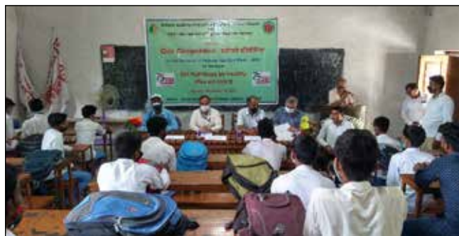
A baseline survey on health status was conducted.